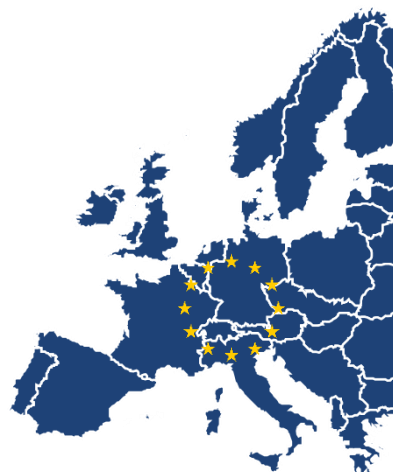
Factory performed clinical trials in countries all over Europe, and many beyond.